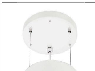
/5M 5 m suspension kit