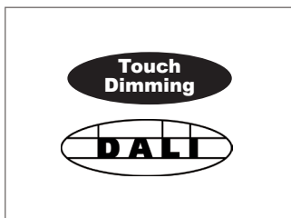
/T+DALI Touch dimming / DALI