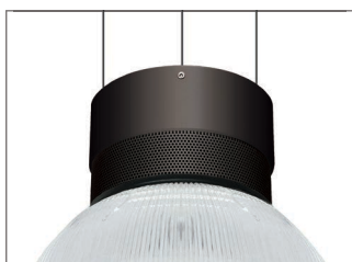
/BB Black, Black