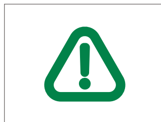
Emergency conversions Contact Sales