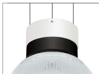
/WB White, Black