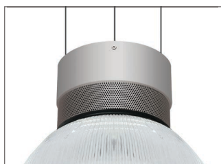
/GG Grey, Grey