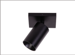
/BL Black body