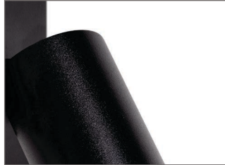
/WB White baffle