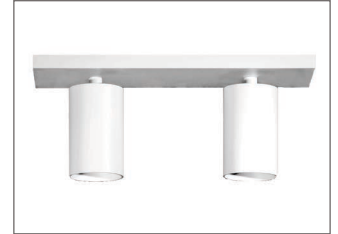
/TW Twin body