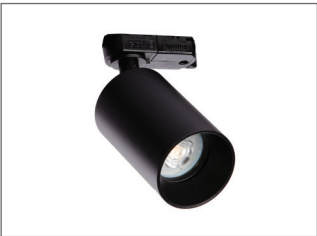
/TK 3 Circuit Track mount