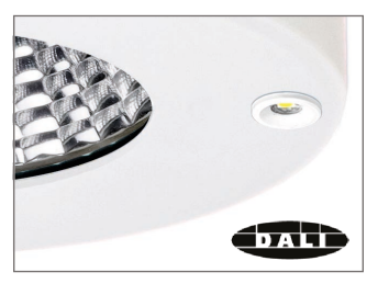
PV - Contact Sales Integral DALI emergency ILEM