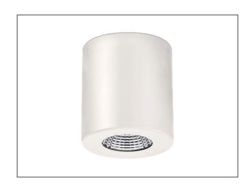
/WH White surface can RAL9010