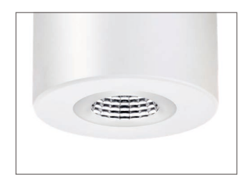
TA220/FROST Frosted hi-light