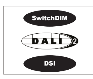
/ECO SwitchDIM, DALI or DSI