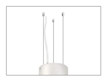
/SUS.B 2 m suspension - 3 x wires