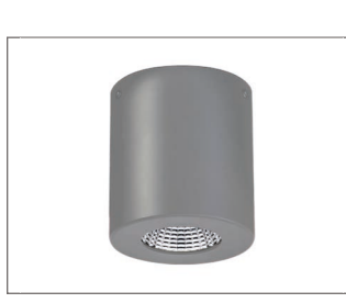
/GY Grey surface can RAL9006