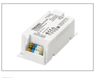
/TOP Tridonic Excite Driver - 100K hours I-Select