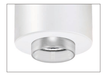
TA210/FROST Frosted snoot