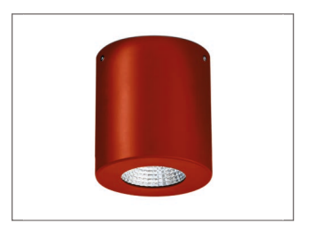
PV - Contact Sales Any RAL colour