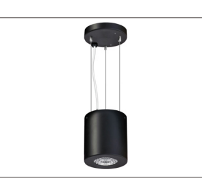
/SUS 2 m suspension - 3 x wires + ceiling plate