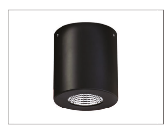
/BK Black surface can RAL9005