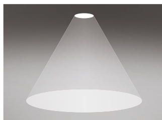
/WB Wide beam reflector