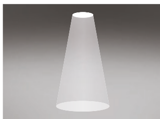
/NB Narrow beam reflector