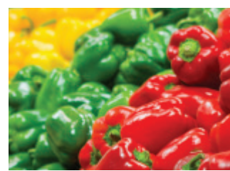
/R9 High colour rendering (Ra 90)