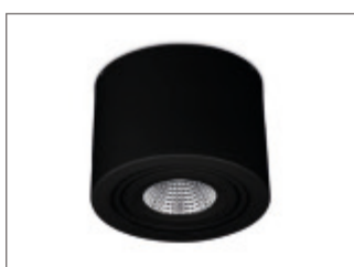
/BK Black body and gimbal