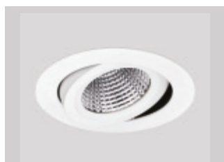
Recessed available See 97 Series